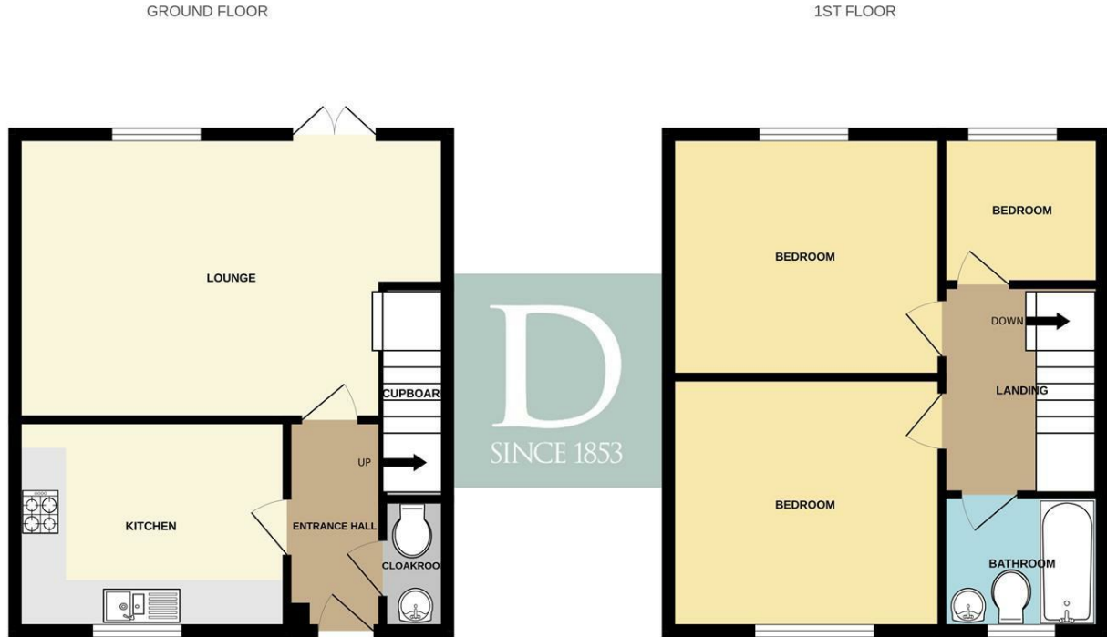
END TERRACE HOUSE

Whilst every attempt has been made to ensure the accuracy of the floorplan contained here, measurements of doors, windows, rooms and any other items are approximate and no responsibility is taken for any error, omission or mis-statement. This plan is for illustrative purposes only and should be used as such by any prospective purchaser. The services, systems and appliances shown have not been tested and no guarantee as to their operability or efficiency can be given. Made with Metropix ©2023